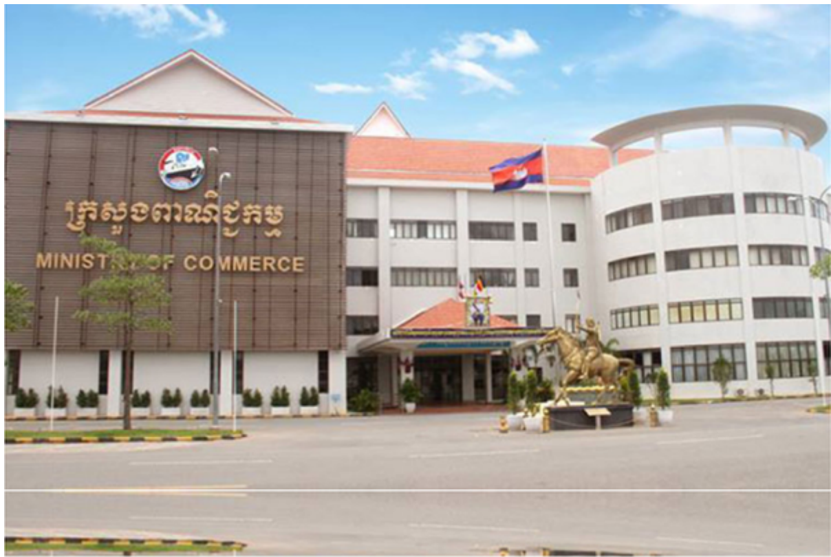
Ministry of Commerce in Phnom Penh, Cambodia

M inistry of Commerce has announced to postpone the penalty fee until July for online business owners who are late to apply for e-commerce permits or licenses due to the uncertainty over business conditions and the impact of the spread of Covid-19.