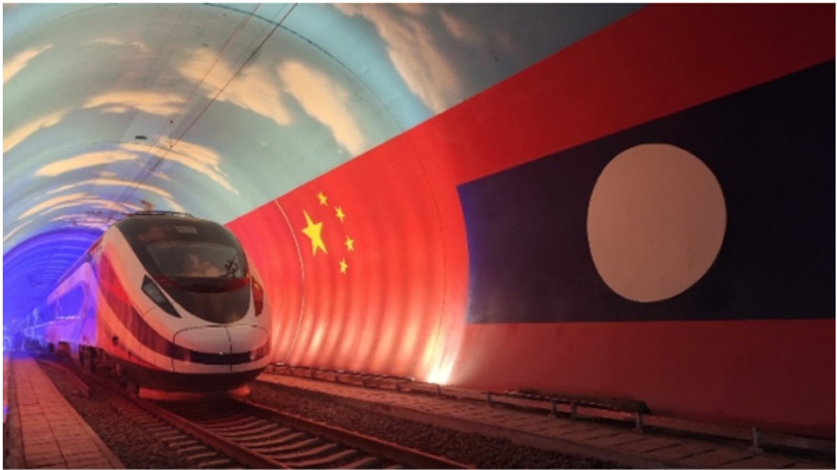
Lane Xang Bullet Train

The dependability of international ground shipping services in Southeast Asia is improving because of improvements in the region's road and rail networks. Furthermore, the pandemic's long-term marine shipping interruptions, supply chains have had to be reexamined.