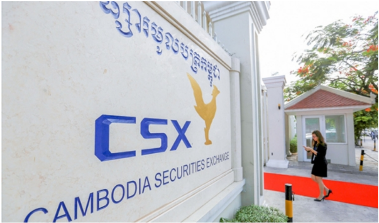
The Cambodia Securities Exchange (CSX)

In order to promote technological infrastructure integration and maintain international competitiveness, the Cambodia Securities Exchange (CSX) has announced plans for all market-listed securities firms to connect their own trading platforms to a synchronized market starting next year.