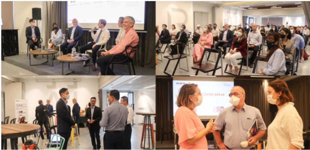
5th SME Export Talks: E-Commerce for Exporting SME, Raintree Cambodia

A RISE Plus Cambodia and EuroCham Cambodia organised our 5th SME Exports Talks focusing on “E-Commerce for Exporting SMEs” on 10 March 2022 at Raintree Cambodia.