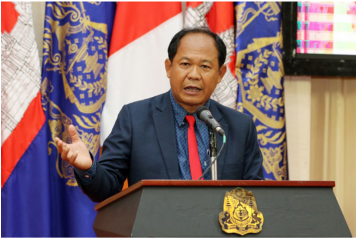
H.E. Oum Reatrey, Banteay Meanchey provincial governor

The Provincial authorities of Banteay Meanchey (Cambodia) and Sa Kaeo (Thailand) met on 10 March to strengthen information cooperation and to examine the progress and feasibility of temporary opening the Stung Bot-Ban Nong lan international border gate, in order to boost trade between the two countries, according to the governor of Banteay Meanchey province. The exact date of the opening has not yet been specified, but the temporary opening is expected to happen soon, even though the administration offices of the two countries are not yet completed.