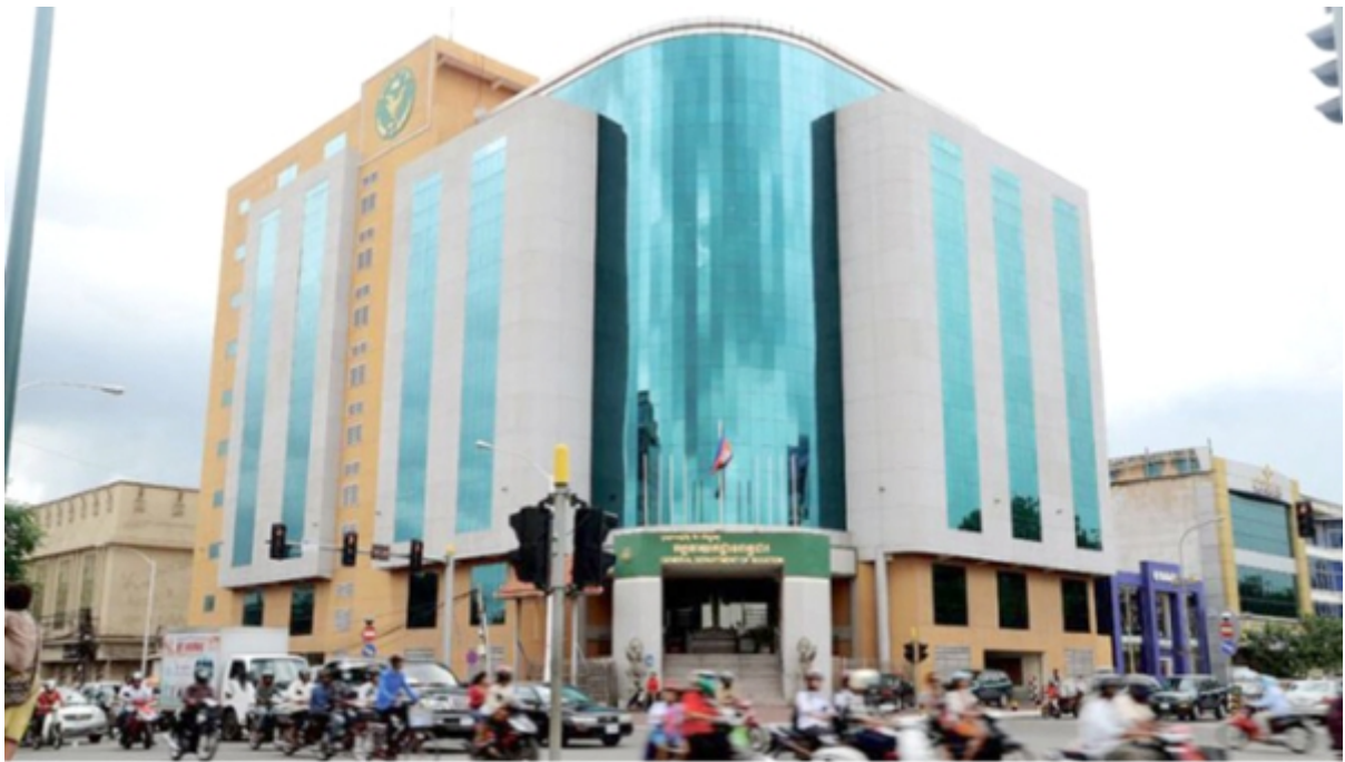
General Department of Taxation Phnom Penh, Cambodia

N otice from the Ministry of Economy and Finance's General Department of Taxation (GDT), stated that the implementation of the capital gain tax will postpone until 2024 to maintain and support the post-pandemic economic recovery.