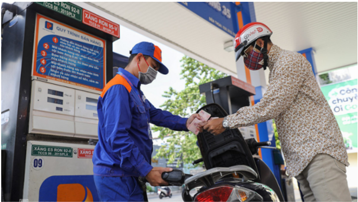
Gas station in Vietnam

Experts have advised that Vietnam must be mindful of imported inflation, particularly as global energy and commodity prices rise, asking the government to focus on increasing exports and reducing imports. Imported inflation, according to Oxford Reference , is inflation caused by rises in the price of imported commodities, which raises domestic production costs and raises the price of domestically produced items.