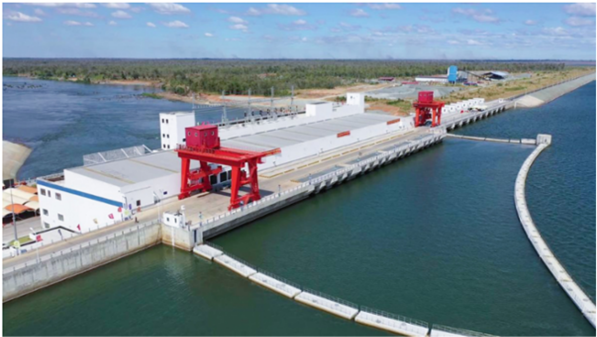
Orussei Hydroelectric Power Plant

P ublic-Private Partnerships (PPPs) are becoming more frequent in the economic sector, particularly among less countries with greater financial limitations and infrastructure needs. PPPs are defined as a “mechanism for the government to procure and implement public infrastructure and/or services using the resources and expertise of the private sector”." according to the World Bank .