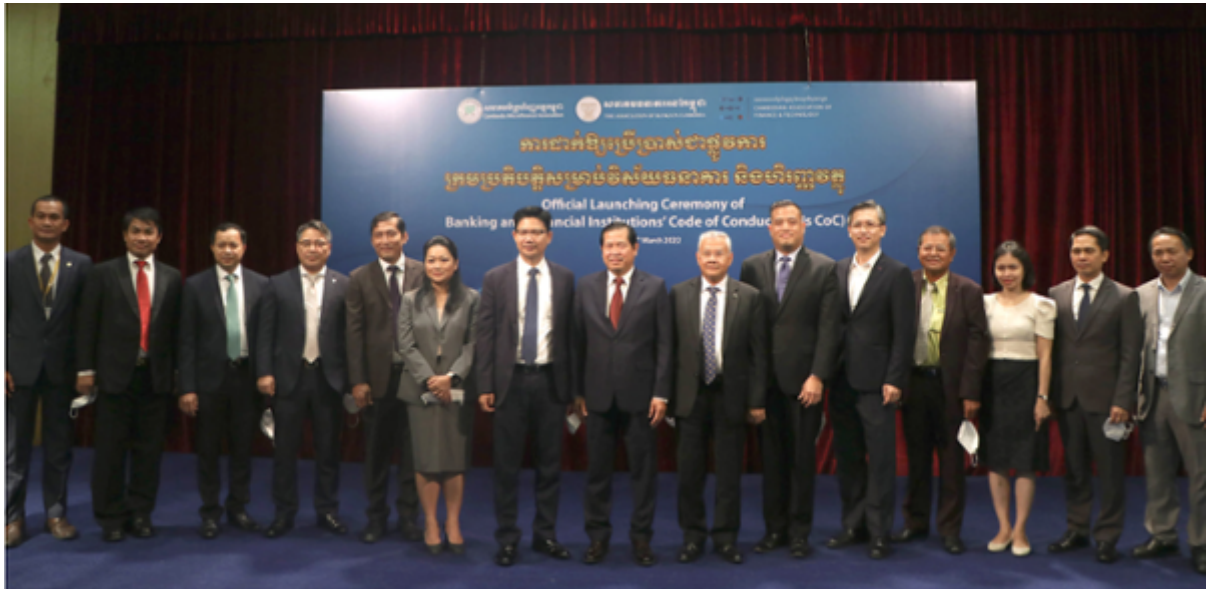
The official launching ceremony of Banking and Financial Institutions' Code of Conduct

Cambodia has launched the code of conduct for banking and financial institution with the goal of promoting effective, reliable, accountable, and responsible banking and financial practices. This was initiated by the Association of Banks in Cambodia (ABC), the Cambodia Microfinance Association (CMA), and the Cambodian Association of Finance & Technology.