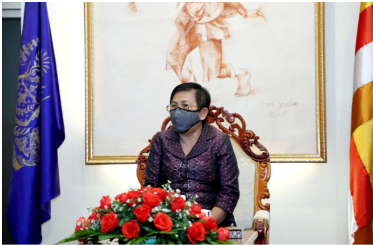
Her Excellency Phoeurng Sackona, Minister of Culture and Fine Arts

On 7 March the Ministry of Culture and Fine Arts informed the public, especially the producers, services providers, NGOs, all local and foreign film companies that for all the requests for permission to shoot a film, documentary film, music video, or TV commercial in the Kingdom, the producers shall apply directly to the Cinema and Culture Diffusion Department of the Ministry of Culture and Fine Arts with the relevant documents such as application form, detailed and summary stories, program, and shooting location, etc.